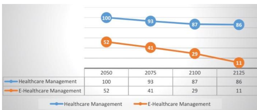
Figure 3. Time spent per patient by healthcare management and E-healthcare management in 2050–2125.