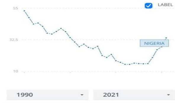
Figure 1. Nigeria’s capital formation (% of GDP).